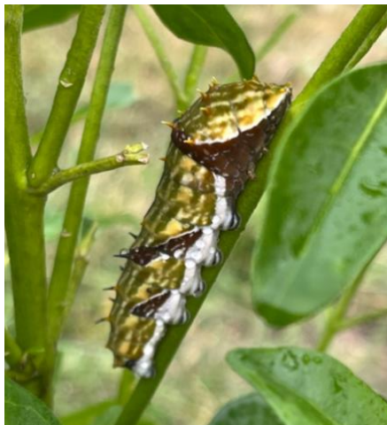
Butterfly caterpillar on Mexican orange blossom