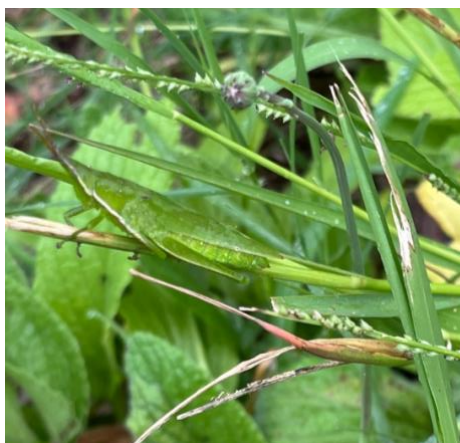
Praying Mantis in that green somewhere