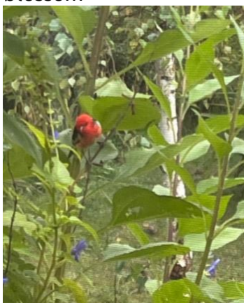
Robin on a Campanula

If you see good looking plants at your location and would like them included in this newsletter, please forward a small photo with description to theboxgirl@gmail.com