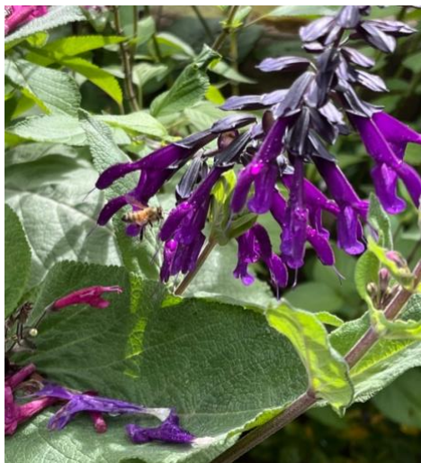
Bee on a Salvia