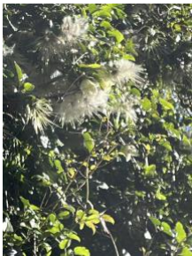
Winter flowering clematis