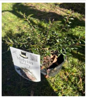
Australian Midyim Berry

Committee meetings are usually the 4 th Wednesday of the month at 10am, and all are welcome to join at the Club. The next meeting is Wednesday 27 August.