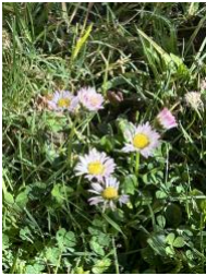
Erigeron or Fleabane