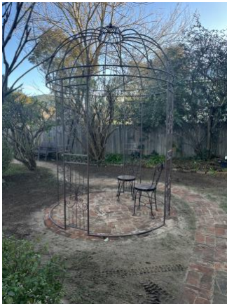
My new arbour