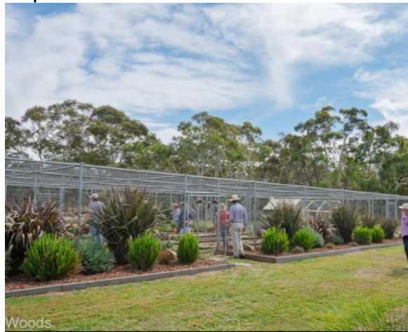
A caged garden

If you see good looking plants at your location and would like them included in this newsletter, please forward a small photo with description to theboxgirl@gmail.com