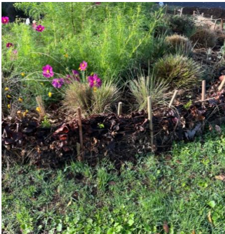
AN interesting garden bed surround