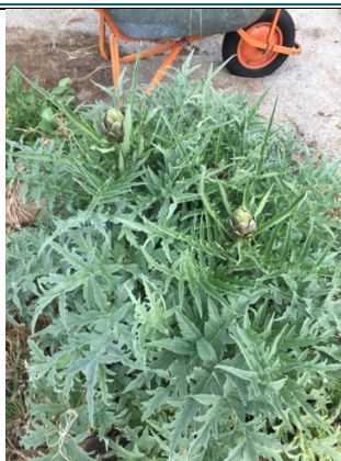
Produce from the garden: Globe artichokes.

We offer the community a chance to pick our produce and do a bit of weeding, and to wander along our paths.