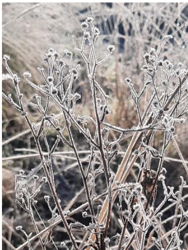
SOME 'ICY' PICTURES

OCTOBER Sunday 27, 2024 Bungendore Show www.agshowsnsw.org.au/shows/all-shows/85-bungendore-show