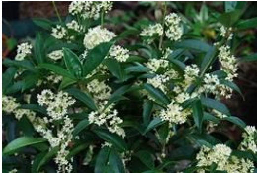
Osmanthus Fragrans (Sweet Olive)