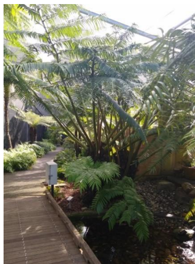
Giant Fern ( Angiopteris evecta )