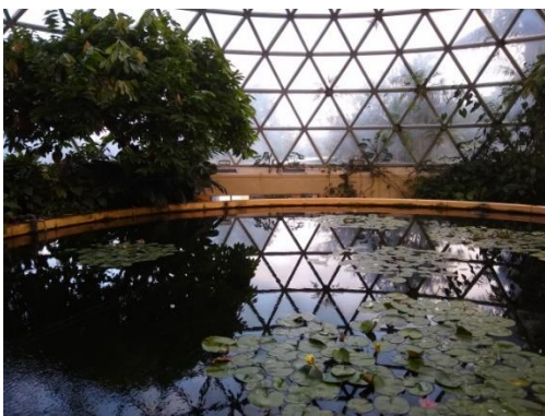
Inside the Tropical Dome

Founded in 1970, the 56-hectare gardens are open daily with free entry and are well worth a visit if you have time to spare when in Brisbane. It offers guided and self-guided walks as well as plenty of picnic spots. It is located about half an hour drive to the south-west of Brisbane's CBD.