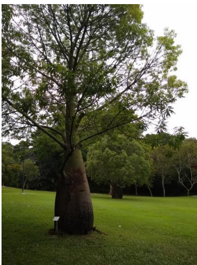
Queensland Bottle Tree