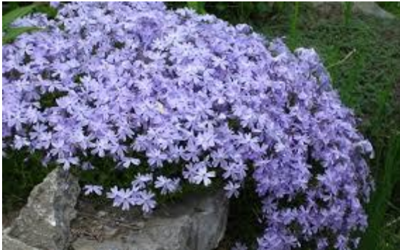
Phlox subulata ( Alpine Phlox)