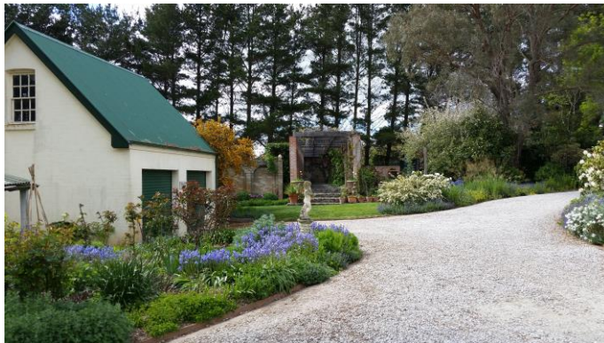
Red Cow Farm