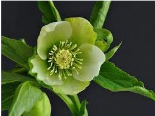
Hellebore viridis (Green Hellebore)