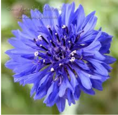
Centaurea cyanus (Cornflower)